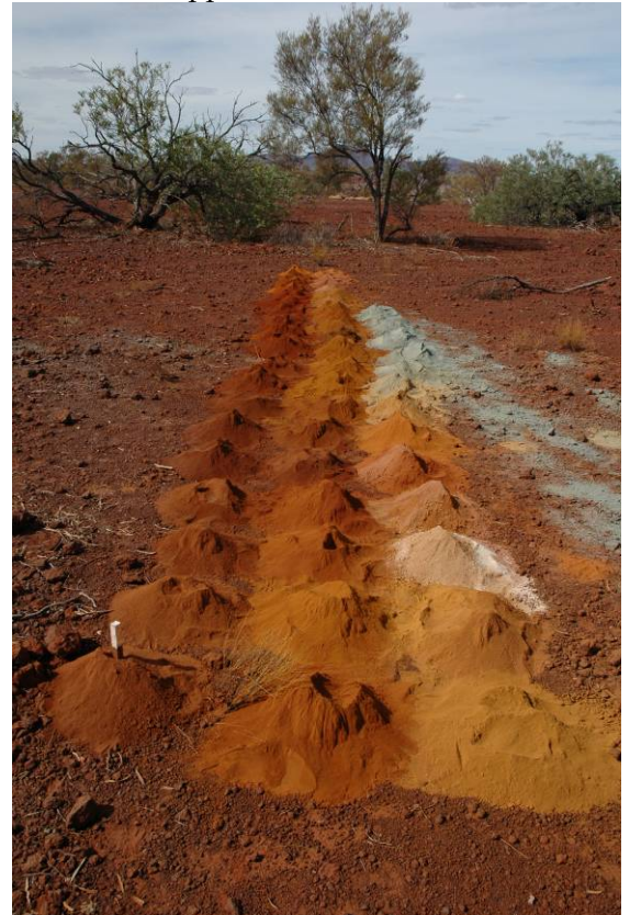
Drill samples at West Pilbara

Nifty area where the JV has a number of tenement applications.